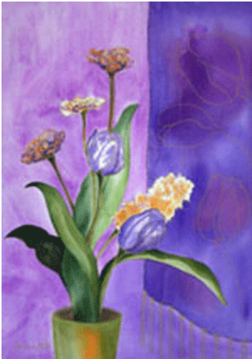
Donated to Project 2008 American Cancer Society Hope Lodge